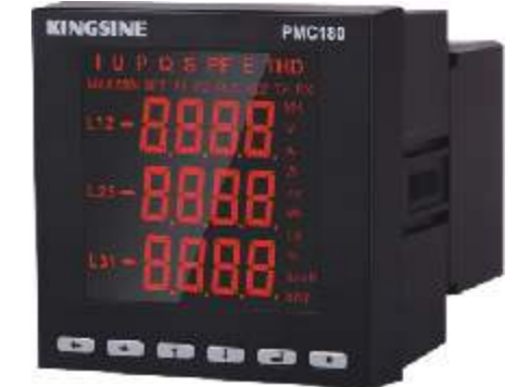
PMC180 (Size: 96×96×72mm) PMC180N (Size: 110×75×72mm)