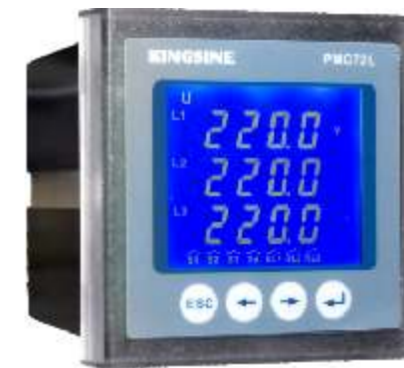
PMC72L (Size: 72×72×95mm)