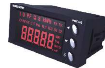
PMC100 (Size: 96×48×95.5mm) / PMC100N (Size: 75×55×120mm)