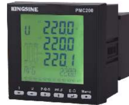
PMC200 (Size: 96×96×72mm)