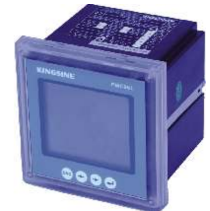
PMC96L (Size: 96×96×102mm)